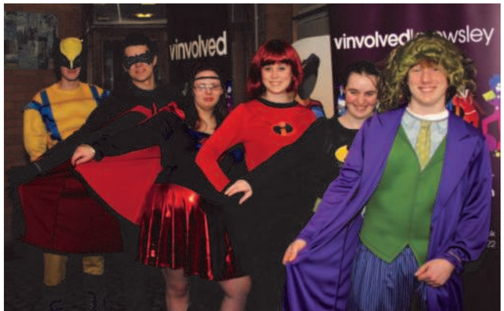
• Young super-heroes - members of Knowsley's Youth Action Team at the Awards ceremony

The themed event was presented by young volunteers dressed up as their favourite