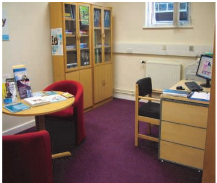
The Knowsley CVS Resource Lounge at Nutgrove Villa, Huyton

Anyone wishing to make use of the Resource Lounge facilities should first report to KCVS Reception, where a member of the team will be happy to provide initial assistance with internet log on etc.